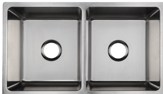
VSR-5050 Neró, 50/50, Stainless Steel

OUTSIDE DIMENSION 31" X 18" X 9" INSIDE BOWL 29" X 16" X 9" INSTALLATION UNDERMOUNT DRAIN SIZE 3 1/2" GAUGE 16G FINISH Stainless Steel NOTES Grid Available Kitchen