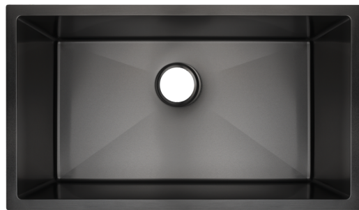
AC-GM-3118 Neró, 3118, Gunmetal

OUTSIDE DIMENSION 31" X 18" X 9" INSIDE BOWL 29" X 16" X 9" INSTALLATION UNDERMOUNT DRAIN SIZE 3 1/2" GAUGE 16G FINISH GUNMETAL BLACK SS NOTES GRID AVAILABLE KITCHEN