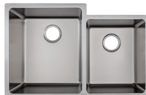
VSR-6040 Neró, 60/40, Stainless Steel

OUTSIDE DIMENSION 31" x 18" x 9" EACH BOWL Each: 14"x 16" x 9" INSTALLATION Undermount DRAIN SIZE 3 1/2" GAUGE 16G FINISH Stainless Steel NOTES Grids Available Kitchen