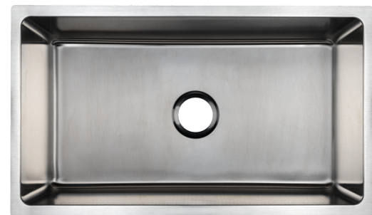
VSR-3118 Neró, 31-18, Stainless Steel

OUTSIDE DIMENSION 31" x 18" x 9" EACH BOWL Each: 14"x 16" x 9" INSTALLATION Undermount DRAIN SIZE 3 1/2" GAUGE 16G FINISH Gunmetal Black SS NOTES Grids Available Kitchen